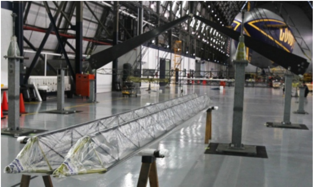
Cross sections that will be part of the interior frame wait to be installed. interior..