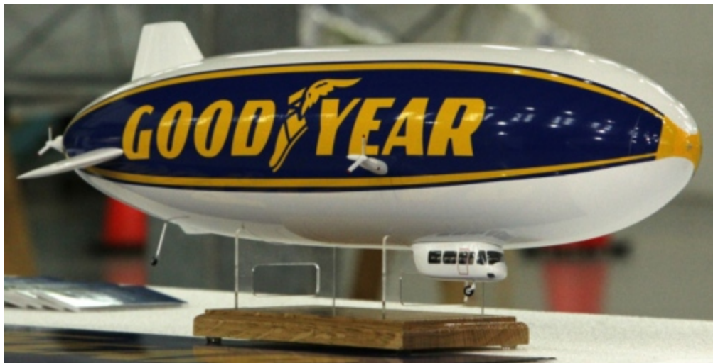
A model of Goodyear's new fleet of airships, the Goodyear NT, sits on a table as construction on the actual airship begins at the Wingfoot Lake hangar. The model is accurate as to how the airship will look but the color scheme will be different.