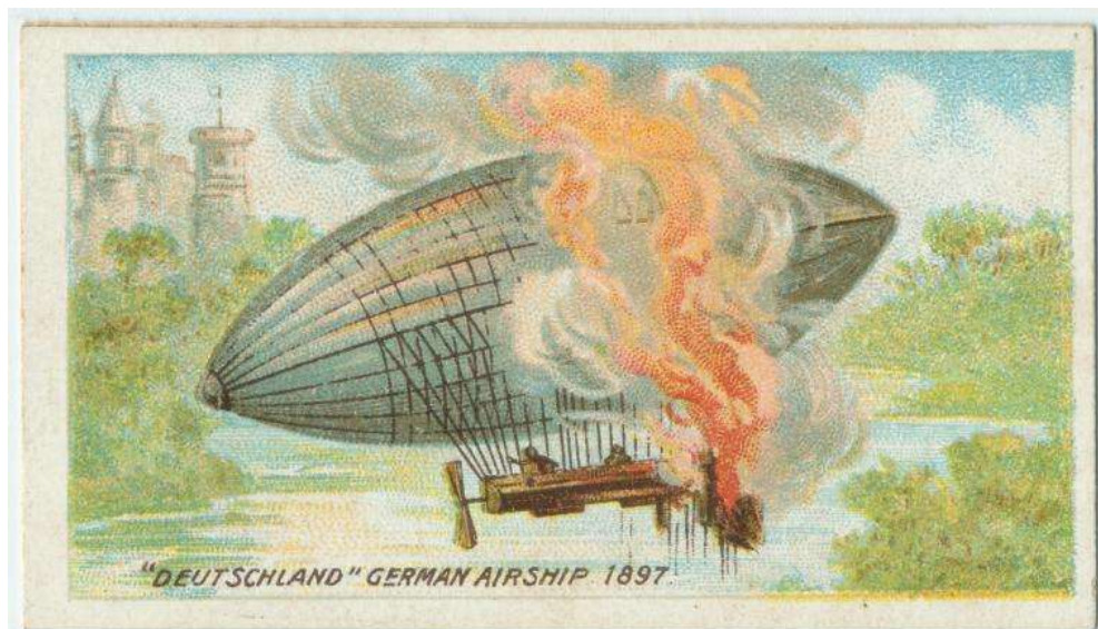
Period depiction of the accident