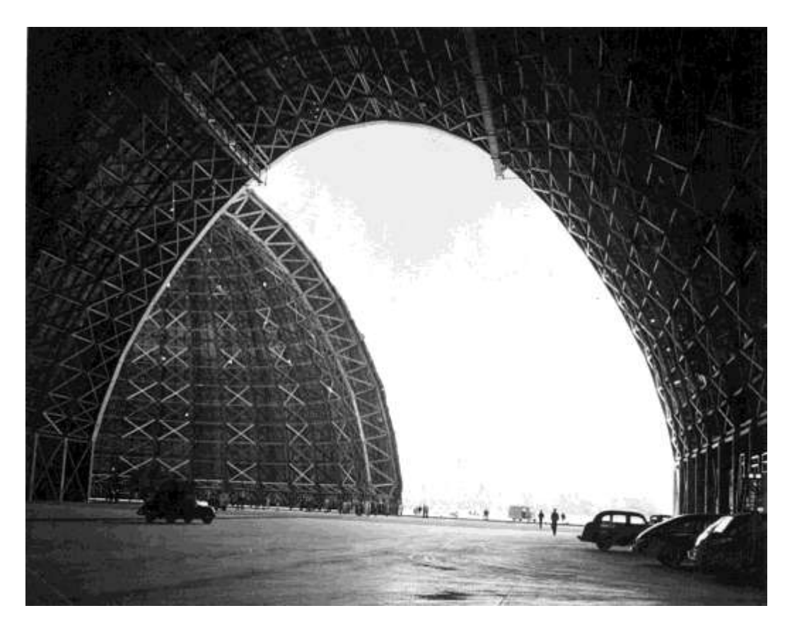
An interior view of the blimp hangar at the Houma Naval Air Station. The cars and people give some idea of scale.

Built in 1943, the hangar could house three fully-inflated K-class dirigibles. Although the hangar was demolished shortly after the war, the concrete foundations of this immense building are still visible from Clendenning Road on Houma's East Side.