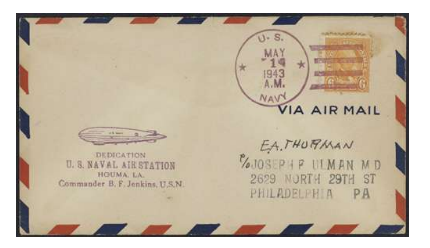
Dedication Day Cover mailed May 1, 1943

The remnants of the base barracks are now home to the School for Exceptional Children and the Terrebonne TARC.