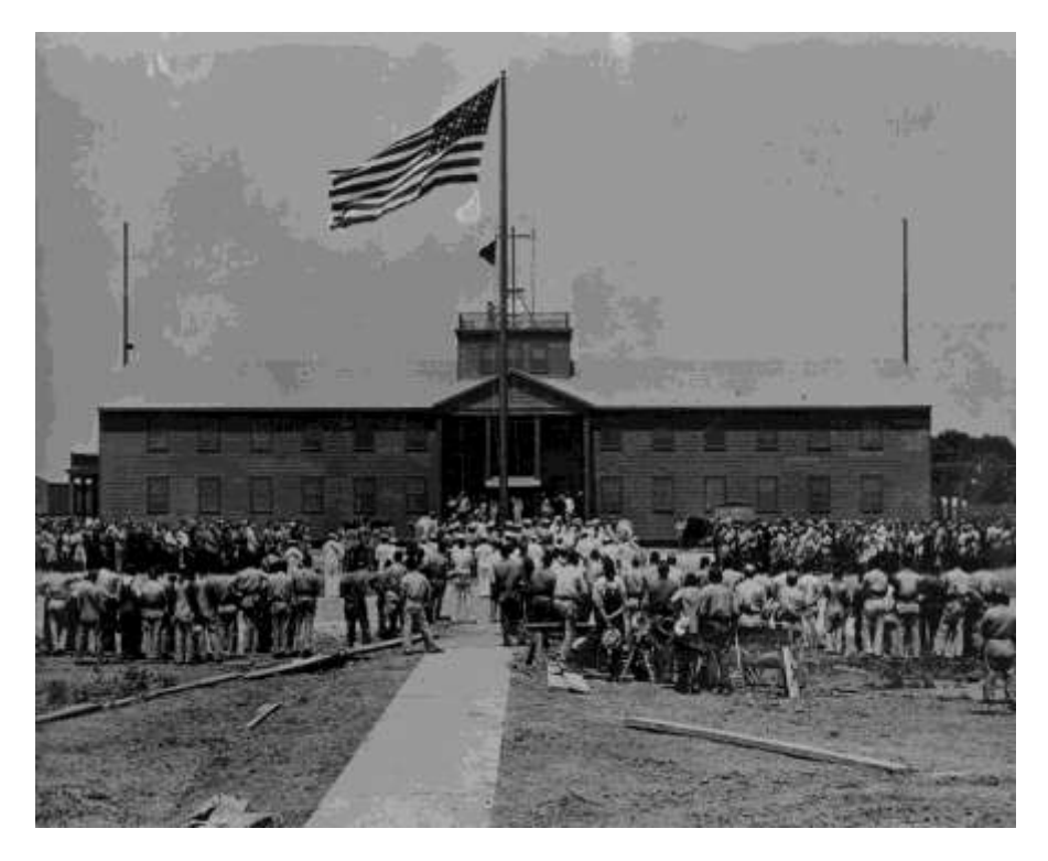
The Non-Commissioned Officers' barracks of the Houma Naval Air Station during construction.

The United States Naval Air Station at Houma was a Lighter Than Air (LTA) or Blimp Base that served anti-submarine warfare purposes for the U.S. Navy during World War II. The Air Station was officially commissioned on May 1, 1943.