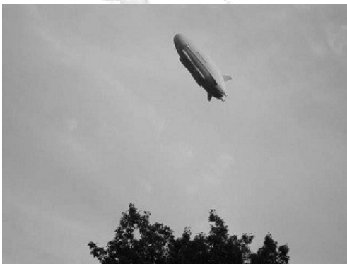
The Northrop Grumman LEMV during its maiden flight over New Jersey