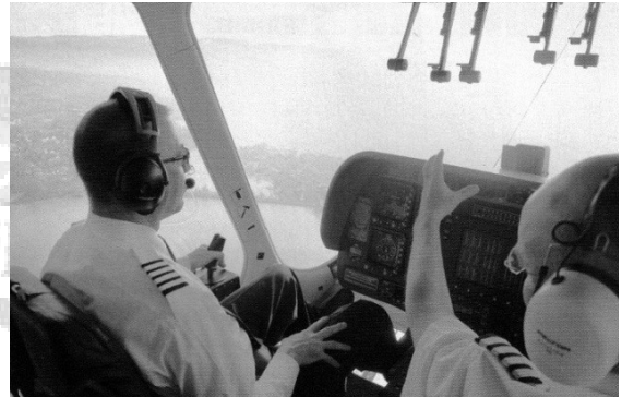
Goodyear pilot training in Friedrichshafen February of 2012

requirements established by the manufacturer. This included not only the production processes themselves, but also material and inventory management processes, quality assurance and document management. The Zeppelin personnel found the processes established by Goodyear to be fundamentally sound and highly professional.