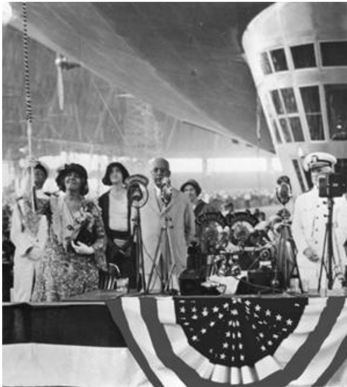
First Lady Lou Hoover releases a flight of pigeons during the christening ceremony of the U.S.S. Akron (ZRS-4)