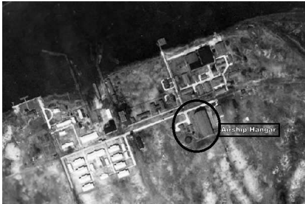
Aerial view of the Camp May NJ

In January of 1919 the US Navy ordered the O-1 airship from the Stabilimento Costruzioni Dirigibili ed Aerostati of Ciampino, Italy. The airship first flew in Ciampino on March 27, 1919. It was shipped from Genoa to Philadelphia by boat, transferred to Akron for review. From Akron it was shipped to Cape May, New Jersey for erection. Its first flight in the United States took place on September 16, 1919.