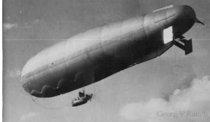
The La Plata, an Argentine Navy O-class airship, similar in design to the US Navy's O-1

After just three years in service, the O-1 was scrapped in late 1921 or early 1922.