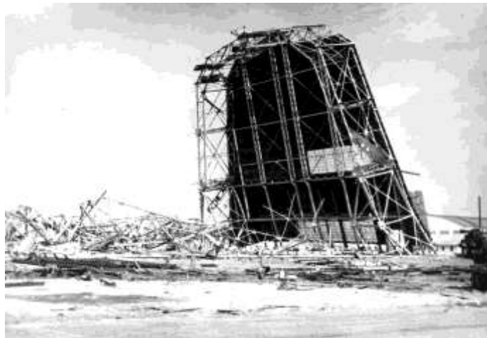
The Cape May NJ airship hangar being torn down in 1938

The hangar at Cape May was lengthened to accommodate rigid airships, however it was never used for these. The airship hangar was demolished in 1938.