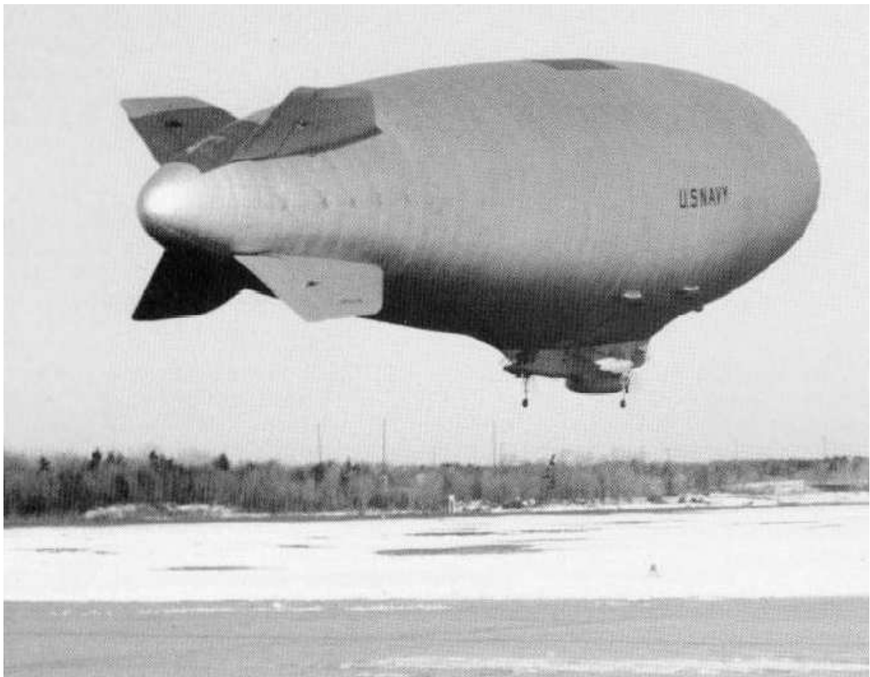
ZPG-2 at South Weymouth Naval Air Station

At 2240 hrs. we cleared Churchill and set course for South Weymouth. Shortly after sunrise, the Severn River was crossed and at noon the airship passed over Cochrane, Ontario, causing considerable excitement. Nearly everyone in town was out in the streets. During the evening, several thunderstorms were circumnavigated north of Mattawa, Ontario, but otherwise the flight across Ontario and down the Ottawa River, across the Rideau Lakes to Lake Ontario, and down the Mohawk Valley and Hudson Valley, was uneventful. At 0825, 12 August we landed at South Weymouth, 32 hours after departing Churchill, and almost 78 hours of continuous flight after taking off from Resolute Bay on 8 August. The operation demonstrated that a ZPG-2 airship can provide low altitude, slow speed, visual and photographic reconnaissance over a wide radius in the Arctic, and, in addition, it is an excellent platform for scientific investigations.