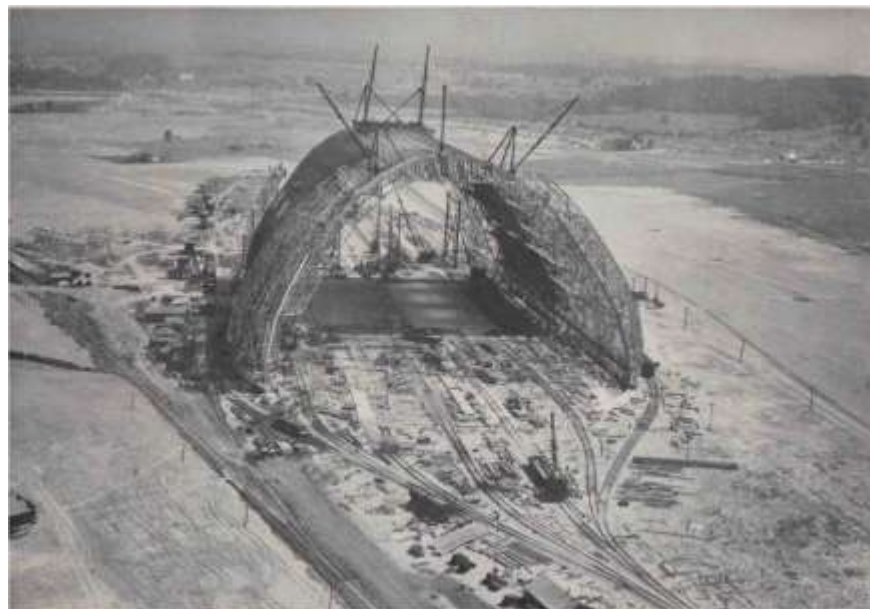
The Goodyear-Zeppelin Co. 's Airdock, in Akron, Ohio, about 50% complete.