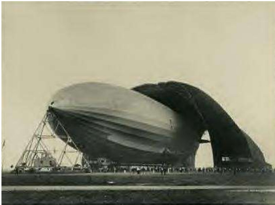
One of the Navy's rigid airships is towed out of the Airdock in Akron, Ohio.